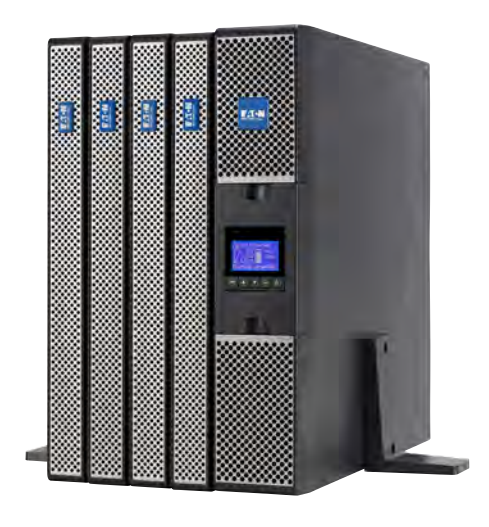
For even more runtime, add up to four EBMs to your 9PX UPS